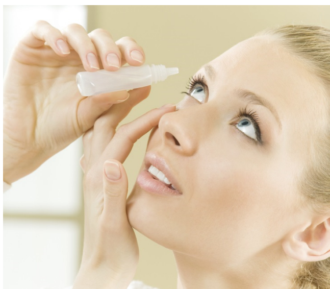
Figure 1: Dispensing drops of ophthalmic liquids

Ophthalmic solutions and liquids (eye drops) are used to apply active pharmaceutical ingredients (API) directly to the eye. Surface tension measurement plays a key role for these solutions, as the surface tension is the only parameter manufacturers can control over a wide range that determines the droplet size. According to Tate, drop volume decreases with decreasing surface tension. The accessibility and significance of the surface tension makes it an important parameter for quality control (QC) measurements.