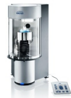
Force Tensiometer – K11

Keywords: Ophthalmic solutions, eye drops, surface tension, drop volume, dosing