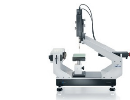
Drop Shape Analyzer – DSA25