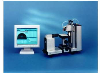
Drop Shape Analysis System DSA10