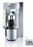
Force Tensiometer – K100

fiber coating, composite, non-woven, adhesion energy, surfactant, interfacial tension, coating thickness, wear resistance, Marangoni effect, critical micellar concentration CMC