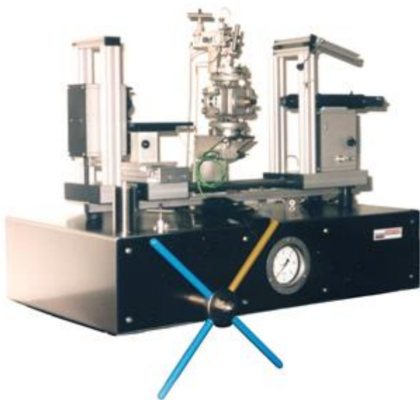
Fig. 1: PD-E40 for measuring interfacial tension and contact angle.

In cooperation with the company KRÜSS GmbH the Eurotechnica GmbH has developed an apparatus based on the measuring method of the pendant, standing or sessile droplet [1], that allows measurements close to the operating conditions of liquid-liquid separation columns working in the droplet- and falling film mode. When joining two fluid phases within a pressure tight view cell, defined conditions regarding pressure, temperature and composition of the adjoining phases can be adjusted. The interfacial tension of the adjoining phases can thus be determined close to conditions of the actual process especially in dependence on their compositions.