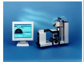
Drop Shape Analysis System DSA10